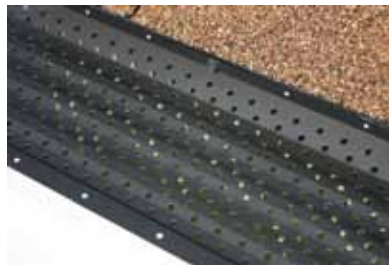
The BULLDOG's patented ribbed design encourages airflow to lift debris off with a gentle breeze.