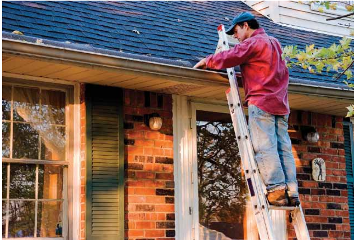
Unique Patented Filtration System Eliminates the hazardous chore of climbing a ladder.